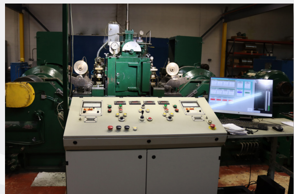
Sendzimir Cold Reversing Mill